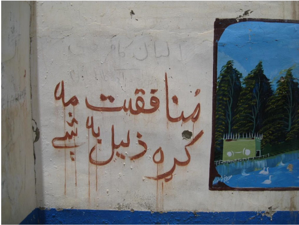
Figure 4. Anti-Munafiqat Graffiti from the Pakistan Taliban in South Waziristan

This Pashto caption translates as “Don't indulge in munafiqat (hypocrisy) or you will be debased.” This inscription is believed to be written in blood by the Pakistan army, but the author cannot confirm this claim.