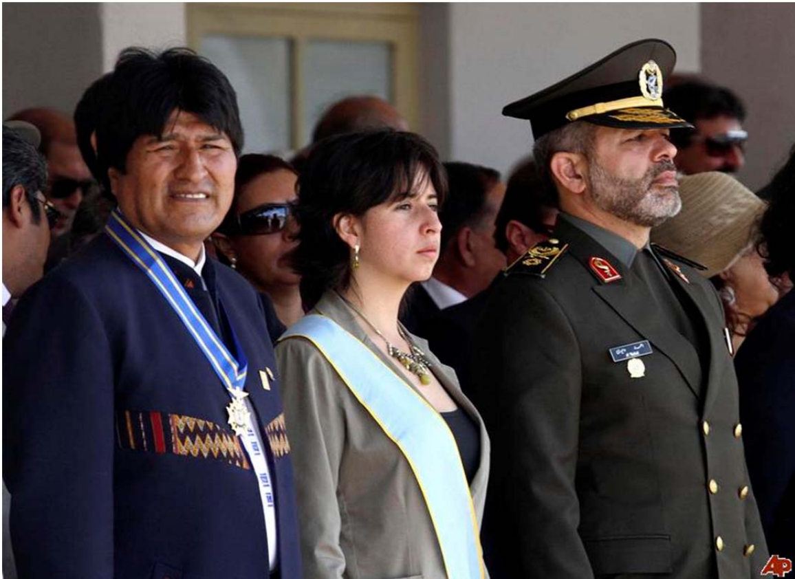
Figure 2: Bolivian President Evo Morales and Iranian defense minister Ahmad Vahidi at a military ceremony in Santa Cruz, Bolivia

This ideological framework of Marxism and radical Islamic methodology for successfully attacking the United States is an important, though little examined, underpinning for the greatly enhanced relationships among the Bolivarian states and Iran. These relationships are being expanded and absorb significant resources despite the fact that there is little economic rationale to the ties and little in terms of legitimate commerce.