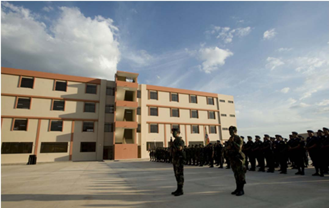
Figure 1: ALBA School, Warnes, Santa Cruz, Bolivia

Facing this aggressive power (the United States) the countries and peoples of the region have no choice but to seek ways to defend themselves. The just struggles of the Latin American peoples for independence, freedom and social progress deserve the support of everyone. 23