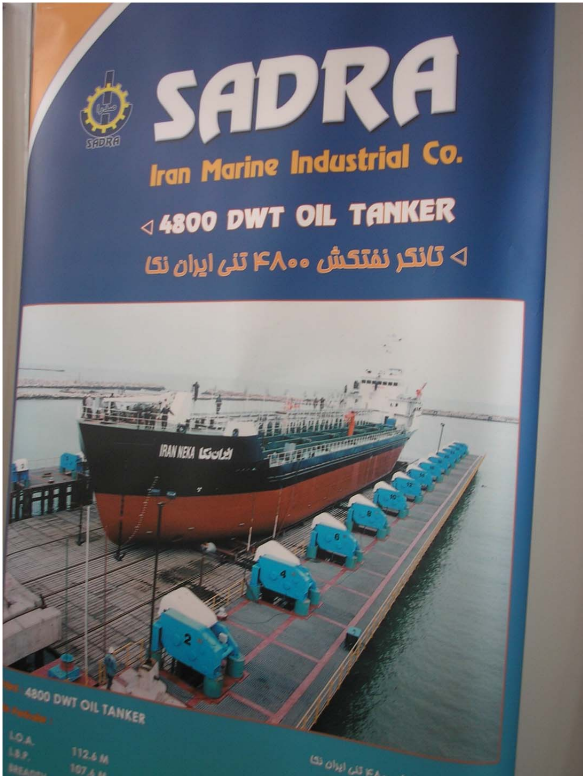
Figure 4: SADRA poster at a booth in the Iran-Venezuela Industrial Fair, August 2010