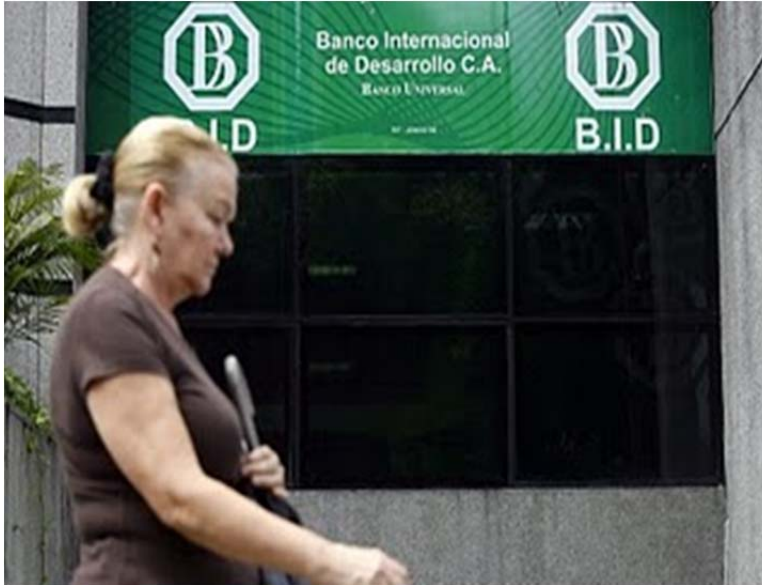
Figure 3: The BID in Caracas.

According to local banking industry sources, BID operates correspondent accounts through another government bank, BANDES, which is unsanctioned. This allows BID to move money as if it were of Venezuelan rather than Iranian in origin or from BID.