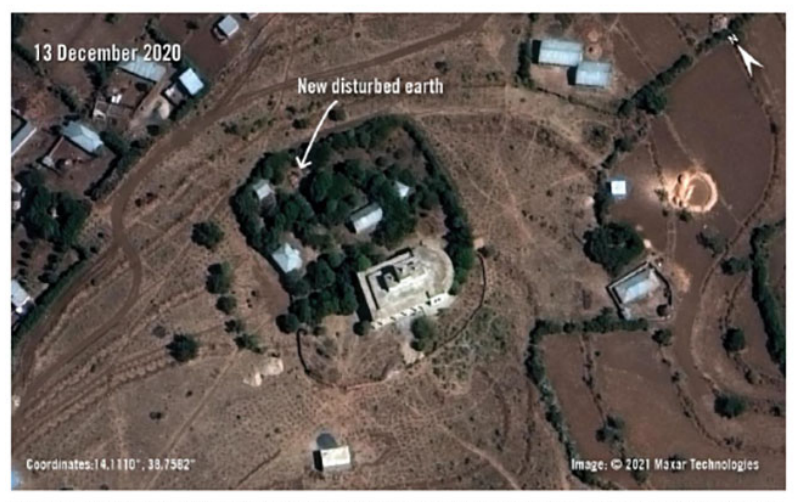
The Abune Aregami church, scated in the Semeret neighbourhood on the southeastern edge of Asum, shows new disturbed earth in satellite imagery from 13 December 2020. While in some churches the victims of the massacre were buried in vaults, witnesses say that in Abune Aregami, the graves were dug in soil.