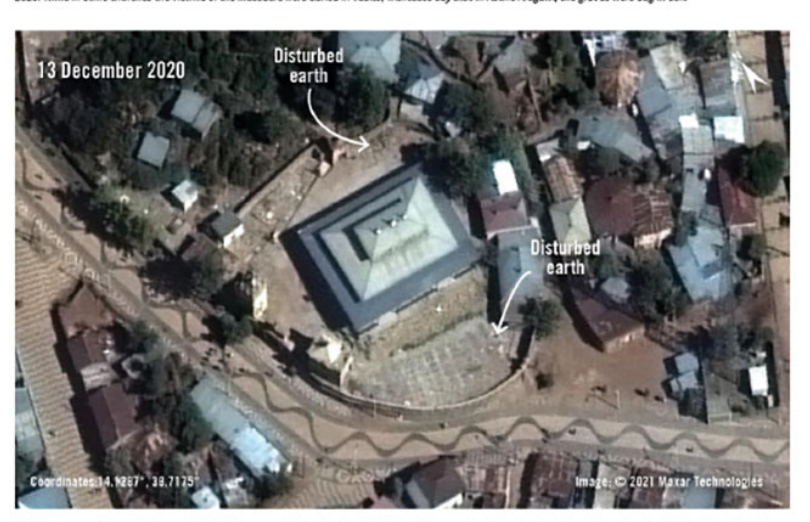
Satellite imagery taken on 13 December 2020 shows new disturbed earth at the Arba letur Ensessa church in downtown Assum. It was here that, in the afternath of the massacre, the largest funerals took place.

Two witnesses who spoke to the church authorities at St Mary of Zion church (which encompasses Maryam Zion church proper as well as Arbeatu Ensessa) said 450 identified people were buried in that church alone. The figure excludes people who were buried there but not identified; the dead who were buried in other churches; and those who were buried on the roadside.