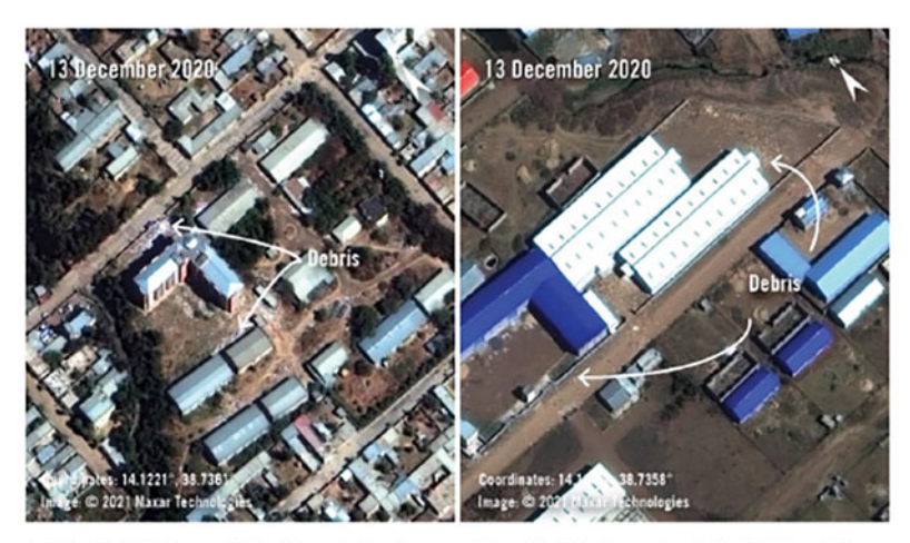
Debris consistent with looking around buildings that appear to be warehouses or industrial facilities, on the southern edges of Asson, shown on satellite imagery from 13 December 2020. Entrean forces systematically looted the city. nts said Eritrean soldiers stole sugar and flour from a store called Guna Trading: that they robbed May Alkia, a large community store, of truckloads of sugar, cooking oil and lentils, and that they took floor and animal fodder from the Dejen Floor Factory.