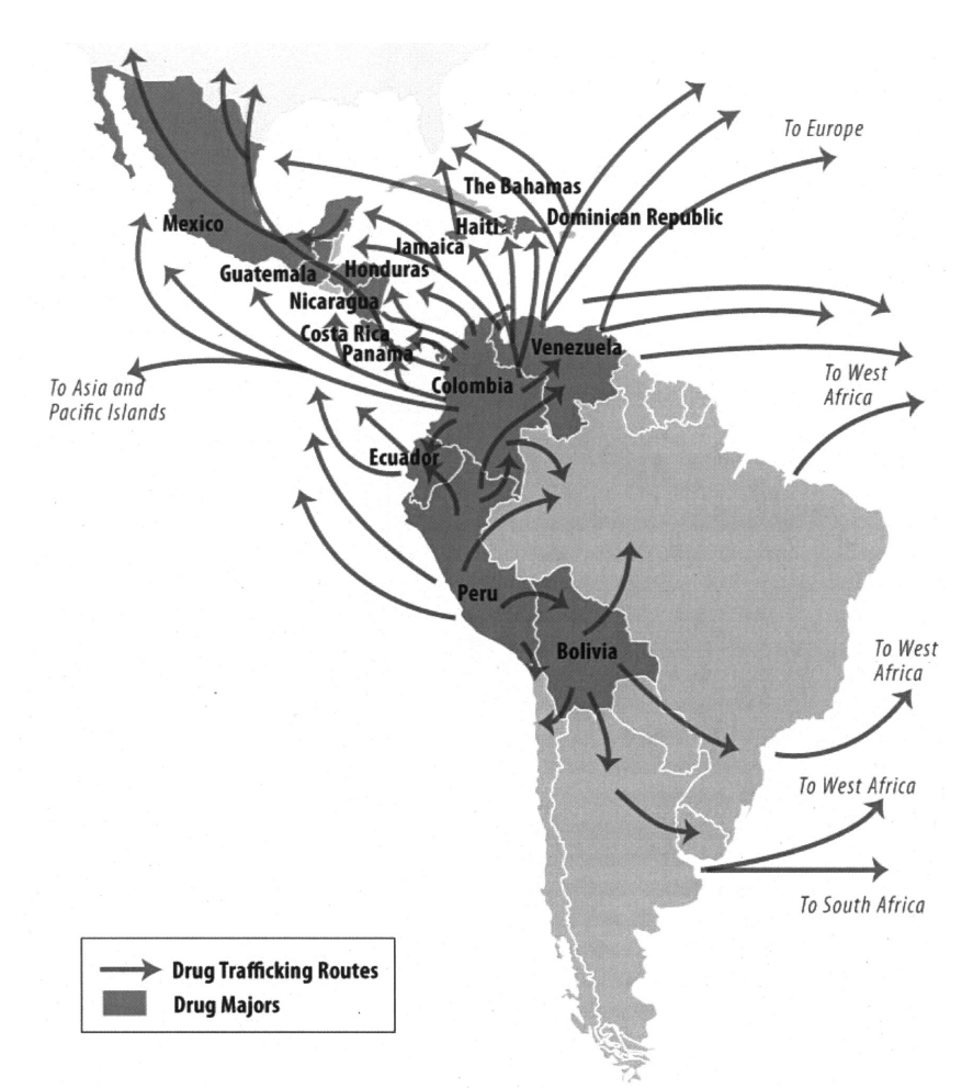
Figure 1: Source, Congressional Research Service

As demonstrated by the extensive connectivity among the producing and transit regions, the concept of initiating a productive Caribbean Basin security initiative without having some strategy for closing the main door through which the drugs enter the region (Venezuela), is likely to be untenable. While the Caribbean is also a transit zone for cocaine leaving Colombia, there is a fundamental difference. The Colombia Government, at great cost in life and national treasure, actively works to combat the trafficking and to drive it from its national territory.