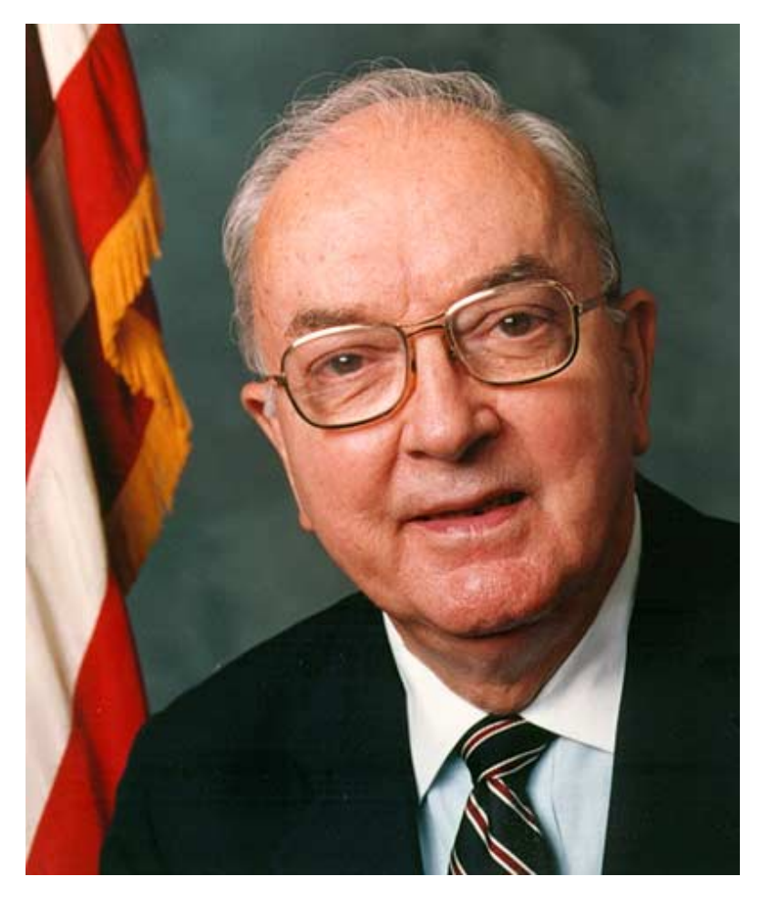
SENATOR JESSE HELMS OF NORTH CAROLINA, CHAIRMAN